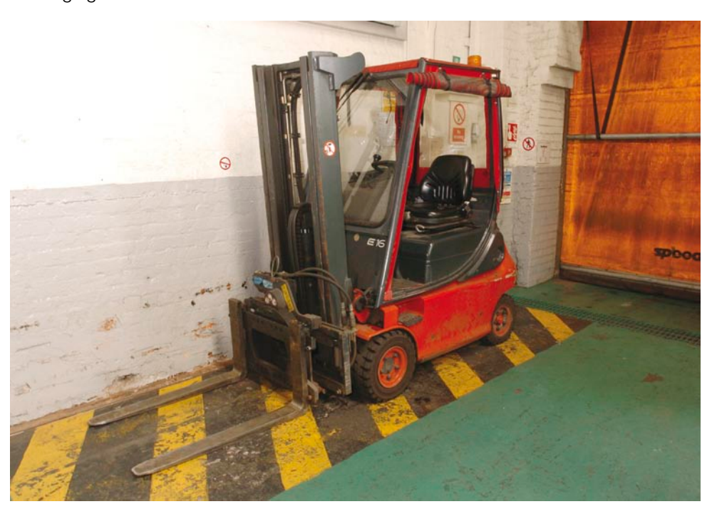
Figure 3 A parking area away from the flow of traffic

137 Provide enough parking areas for all lift trucks. As far as possible, park lift trucks in a secure compound or in a supervised area where they will not be easily accessible to unauthorised people, and preferably separate from main thoroughfares and operating areas. Wherever possible, provide suitable areas for recharging or maintenance.