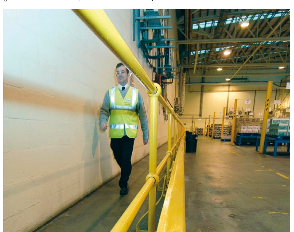
Figure 1 Segregation

120 Also look at HSE's pocket card, Use lift trucks safely: Advice for operators for guidance on how to operate lift trucks safely.