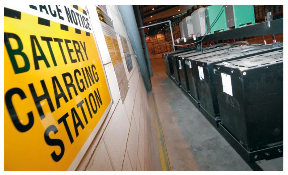
Figure 5 A battery charging station

178 Where batteries have to be changed, for example in a double shift, a safe system of work should be in place. The person responsible for changing the batteries should have suitable training and instruction on how to change them safely. If battery acid may be splashed, wear appropriate protection, for example protective gloves, suitable eye protection and acid-proof clothing.