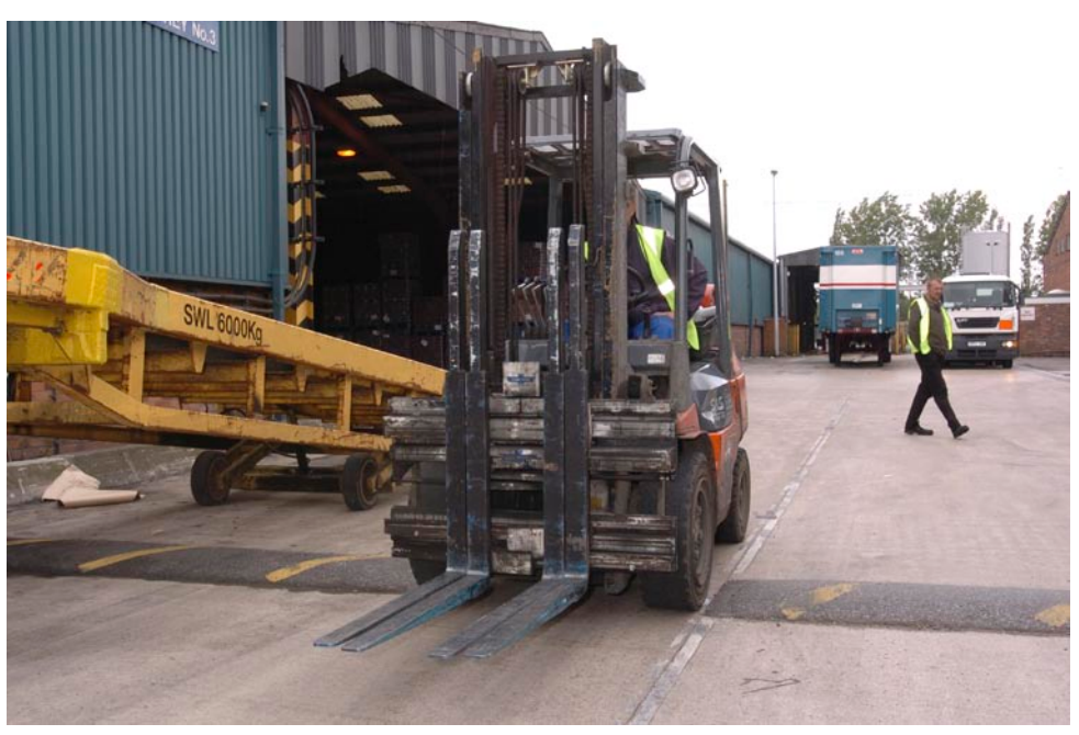
Figure 2 A lift truck passing through an interrupted road hump